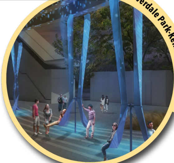
Riverdale Park-Kenilworth Station