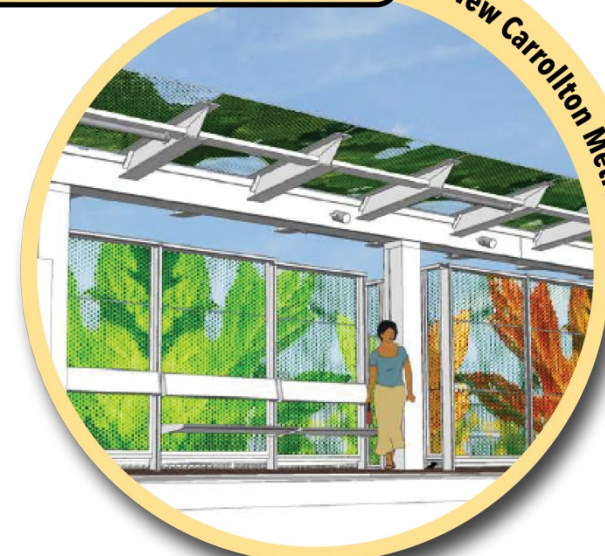
New Carrollton Metro Station