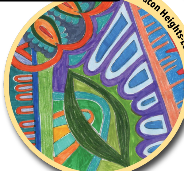
Beacon Heights-East Pines Station